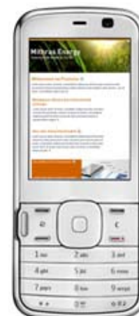
Direct preview from FirstSpirit™