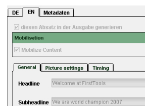
Easy selection of content to be mobilized

The applied technology also makes it possible to compile and merge different contents under one uniform design (content syndication). For example, contents of several Internet portals can be filtered as needed and published with one single mobile portal. Furthermore, mobile presentations can be made even more attractive by simply integrating third party content such as traffic information, weather alerts, stock exchange info, business directories, or maps and trip planners.