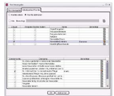
Which workflows are permitted in an object (e.g. a page or a folder)?