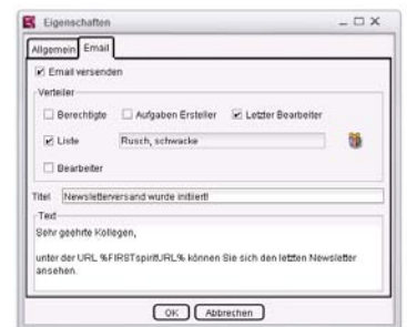
Definition of the mailing list incl. mail text for an activity in the workflow.