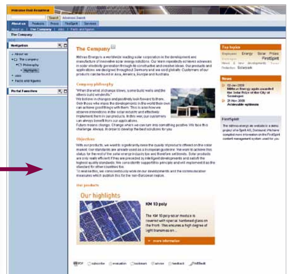
Generated portal view